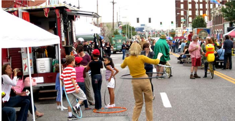
TOP: 2010 Grove Fest BOTTOM LEFT: FPSE Back to School Neighborhood Bash BOTTOM RIGHT: progress at Manchester streetscape improvements project

Shaw Neighborhood Association Quarterly meetings 1st Monday of the month, 7 p.m. St. Margaret of Scotland Church basement, 3854 Flad