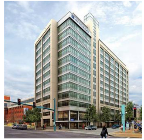
ABOVE: An artist's rendering of the Ambulatory Care Clinic at Euclid and Forest Park Parkway.

Great Frame Up, Cafe Ventana and Brasserie by Niche received Best of St. Louis awards from Riverfront Times.