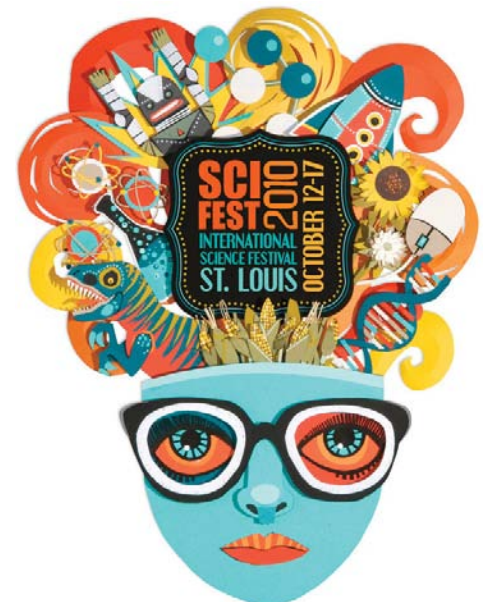
ABOVE: SciFest 2010, held at the Science Center

SciFest took place at the Science Center from October 12 to 17. SciFest, a six day celebration of science and technology, included presentations, discussions, activities, performances and more.