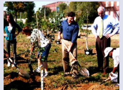
CENTRAL WEST END, MIDTOWN, BOTANICAL HEIGHTS, TIFFANY PAGE 2