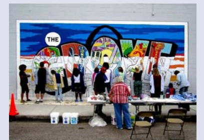
FOREST PARK SOUTHEAST, KINGS OAK, CHELTENHAM, SHAW PAGE 3