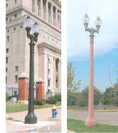
KING LUMINAIRE & STREET POLES