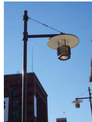
SELUX - QUADRO