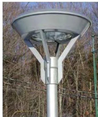
SELUX - QUADRO