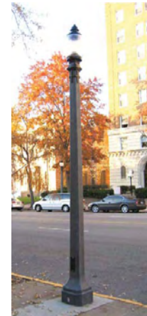
EXISTING NORTH EUCLID FIXTURE KING LUMINAIRE +/- 55' SPACING DARK GRANITIOD POLE