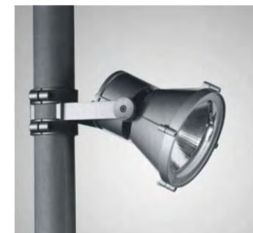
IGUZINNI - PERFORMANCE MULTI-WOODY