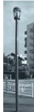
3E INTERNATIONAL - TENNESSEE