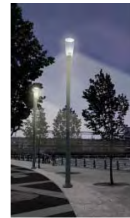
PACE (DW WINDSOR) - DAYTONA